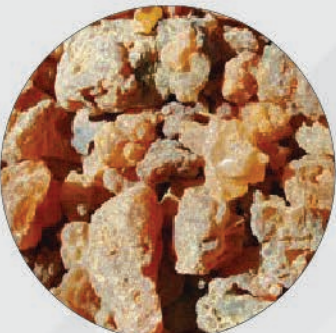
Hing / Asafoetida