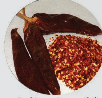
Red Long Sweet Chili Peprika