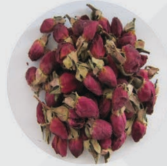
Dry Red Rose Buds