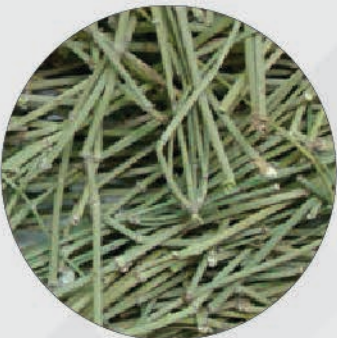
Mahuang / Ephedra