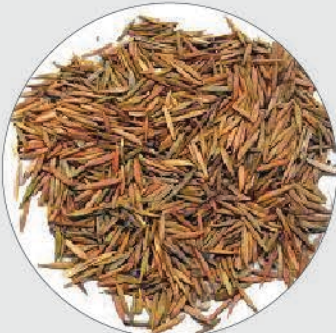
Inderjo Bitter / Sweet