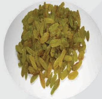
Green Raisins - Long