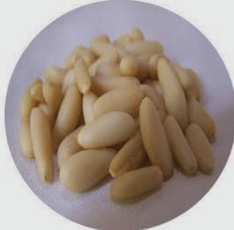
Pine Nuts Kernels