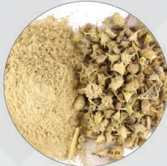
Caltrops / Tribulus