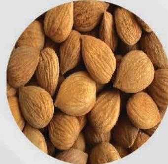
Dry Appricot -Kernel