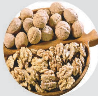
Wall Nuts kernel