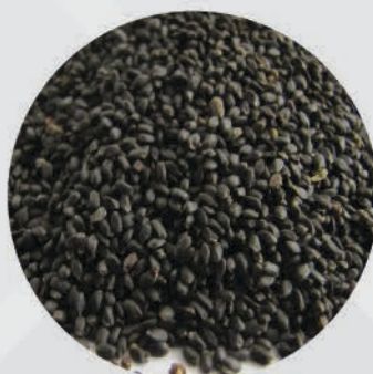
Basil Seeds - Round