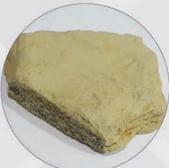
Indian Fullers Earth