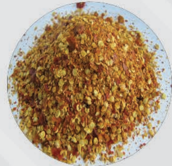
Red Round Chili Crushed