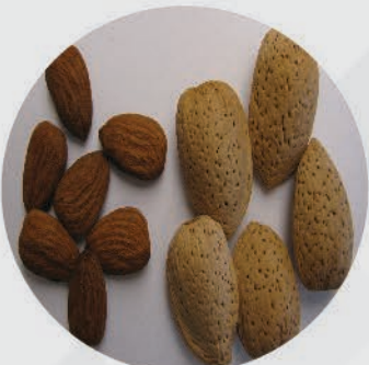
Almond in Shell