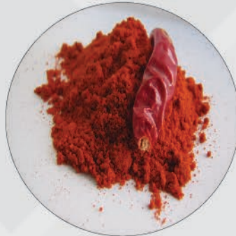
Red Long Finger Chili Powder