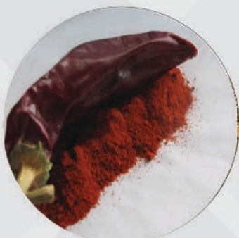
Red long Finger Chili Peprika Powder