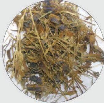
Agrimony / Flower of Ghafis