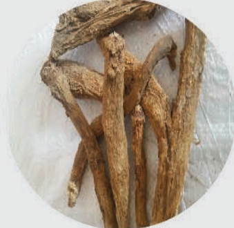
Costus Roots - Bitter