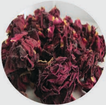
Dry Red Rose Flower