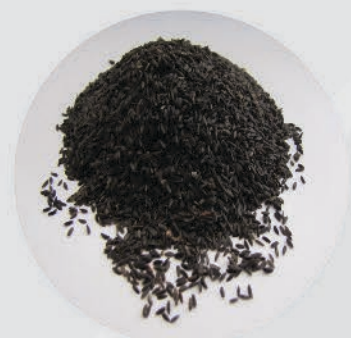
Basil Seeds - Long