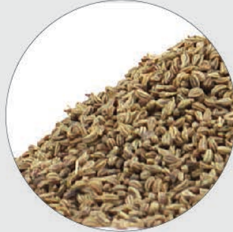
Ajwain - Anise