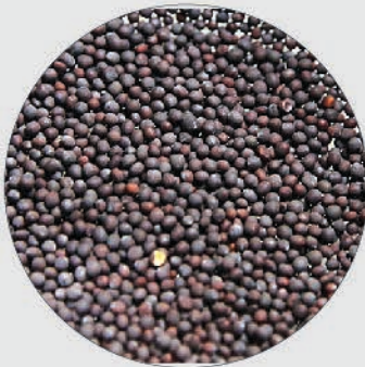
Mustard - Black