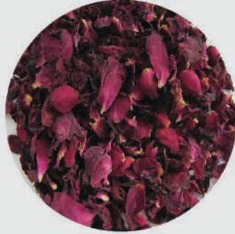
Dry Red Rose Petals