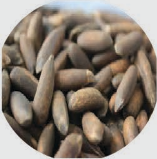
Pine Nuts Whole