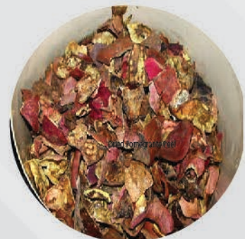
Dried Pomegranate Peel