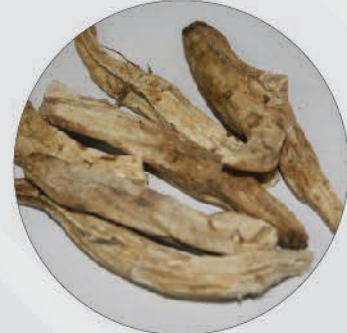
White Behen , White Sage