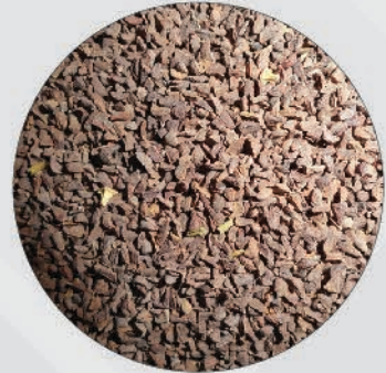
Syrian Rue (Hermal)