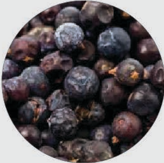
Agrimony / Flower of Ghafis