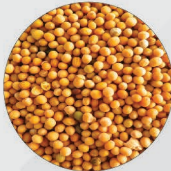
Mustard - Yellow