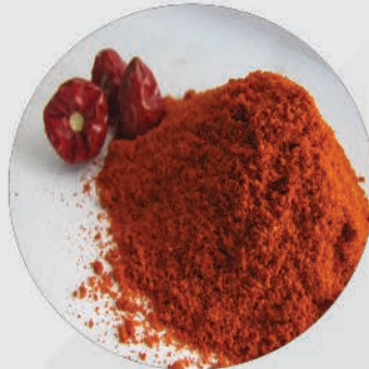
Red Round Chili Powder