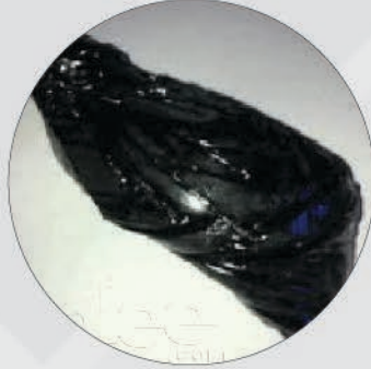
Salijit / Asphalt