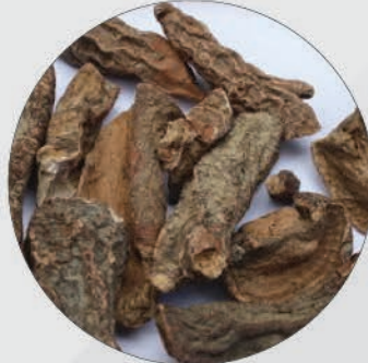
Red Sage, Garden Sage