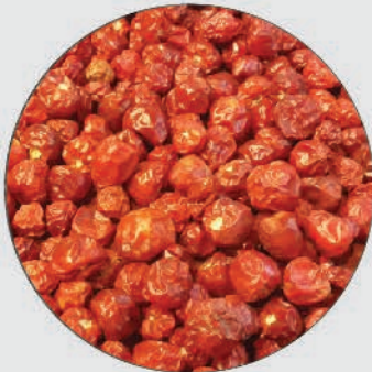
Red Round Chili