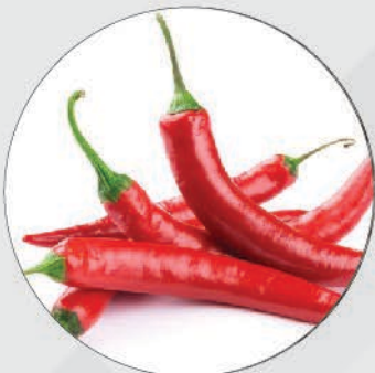
Red long Finger Chili